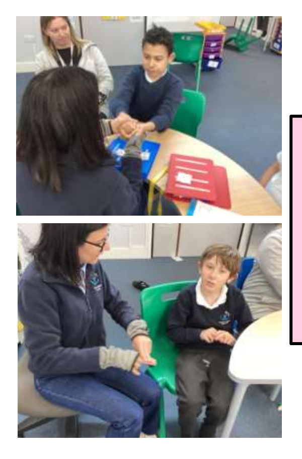
During our daily My Communication lesson , we developed our Makaton signing ,we used 'I DO,WE DO ,YOU DO' teaching method to support learning .Pupils practice our weekly Makaton signs to their best ability .