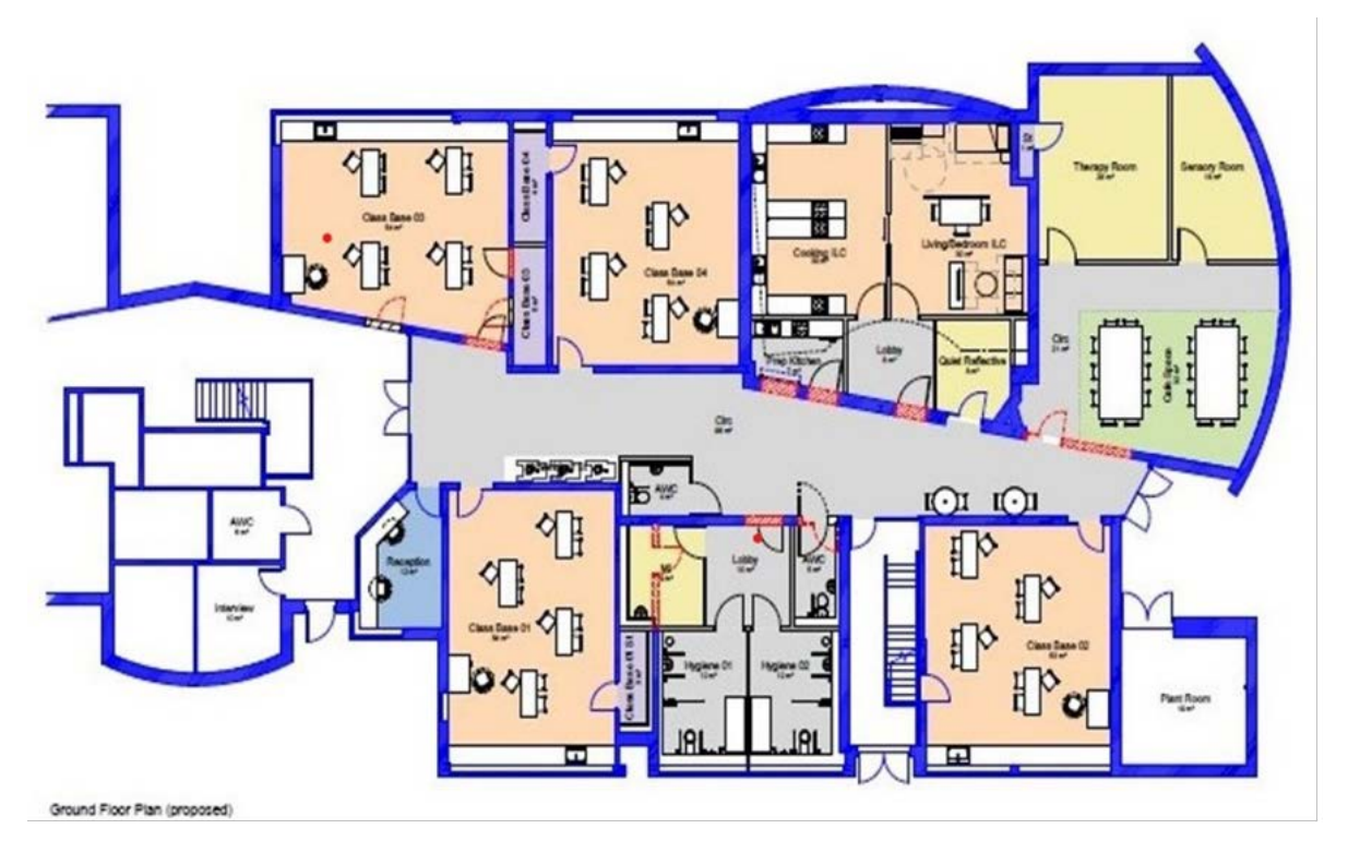
*Example HSDC layout, subject to change

HSDC (Alton Campus) is committed to delivering a variety of holistic inclusive study programmes to young people with a wide range of SEND needs.